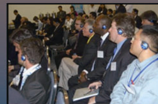
Business Matchmaking Conferences