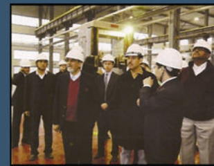
Industrial Sight Visits

More information, please see www.usachinabridge.com